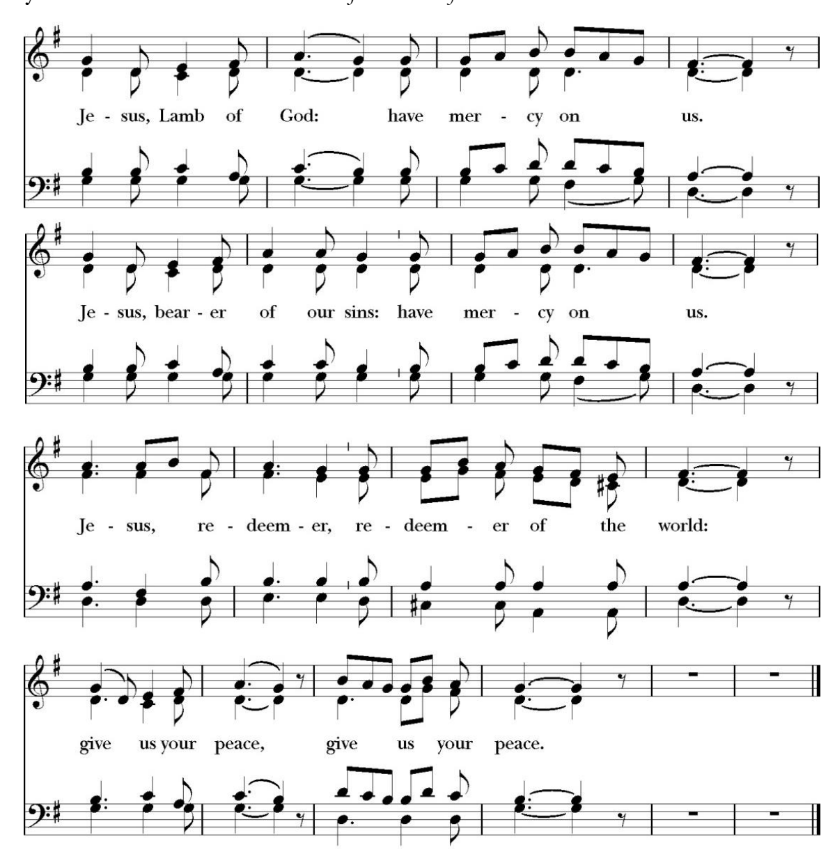
Hymn permission used by Rite Song a one-time use reprint license for congregational use.