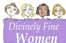
Divinely Fine Women

Please reach out to one another for support during these days of isolation and social distancing.