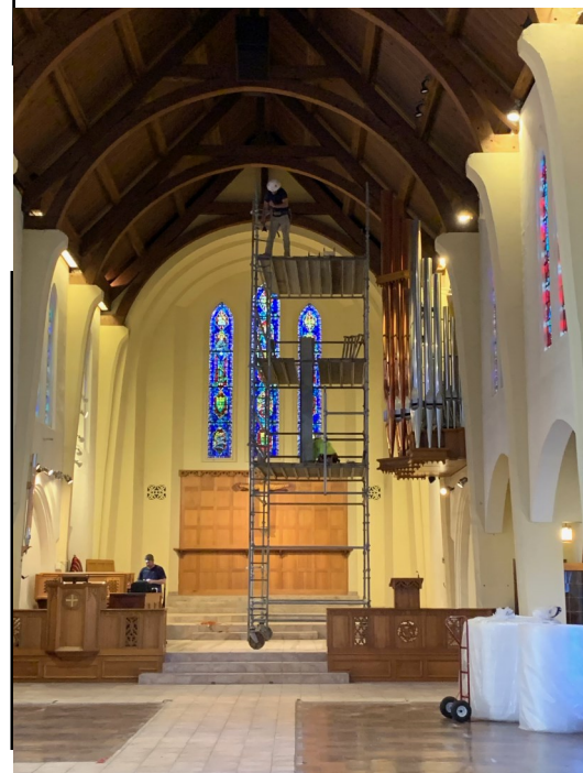
Scaffolding installed June 1 in Chancel to begin removal of organ pipes in preparation for sanctuary renovation